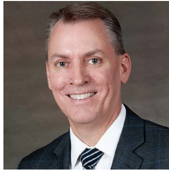
DERMOT SHEA POLICE COMMISSIONER CITY OF NEW YORK

This is an era brimming with hope and opportunity – a time when, even as the COVID-19 pandemic continues to rage, the men and women of the NYPD are proactively working to address increases in crime, improve quality of life, better-engage our young people, and eliminate gang violence. No matter what challenges we face, the NYPD has always led the way toward our city's recovery. We will persevere, as we always do, as one New York.