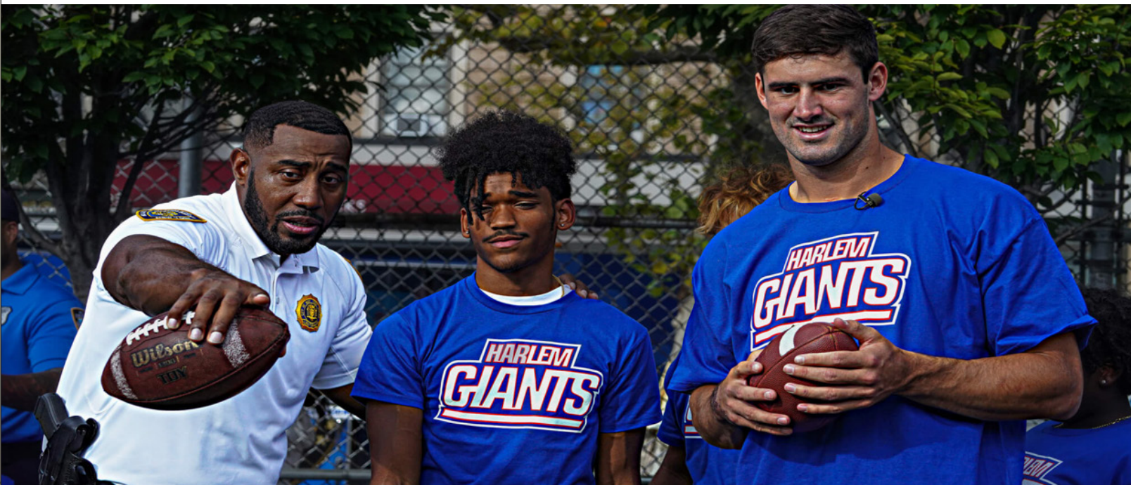
Daniel Jones, New York Giants Quarterback, participates in a Harlem Giants flag football practice