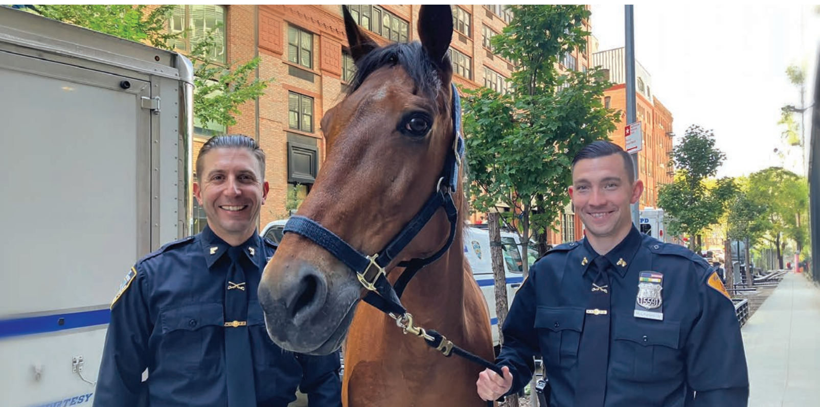
Members of the NYPD's Mounted Unit with their equine partner

The NYPD Lower Manhattan Security Initiative (LMSI) also sought the Police Foundation's help in upgrading its technology to secure new License Plate Reader (LPR) Field Control Units . These devices, deployed in high-crime areas, greatly benefit the outer boroughs and areas where special events are held, and provide 24/7 real time data streams to the NYPD.