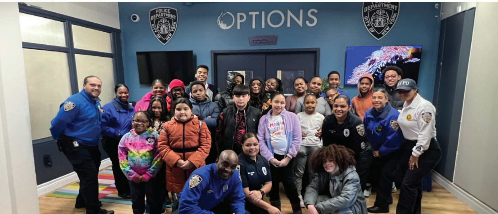
NYPD Options Wellness Center at 19-32 Arthur Avenue

Another popular Community Affairs event sponsored by the Police Foundation, the annual NYPD Prom Impact, was created to foster better community relationships and provide young people in all five boroughs the opportunity to attend their prom - without the financial burden of purchasing a dress, suit, or accessories needed for the festivities. For the past ten years, this program has grown tremendously in attendance and continues to build great partnerships between the NYPD and the communities they serve and protect.