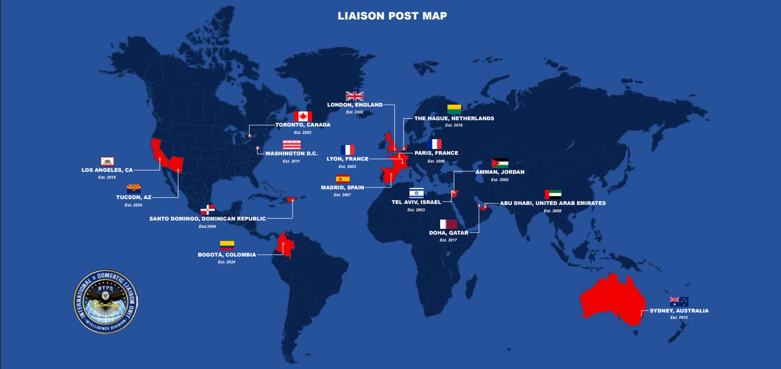
Map of NYPD Liaisons Around the World as of May 2024