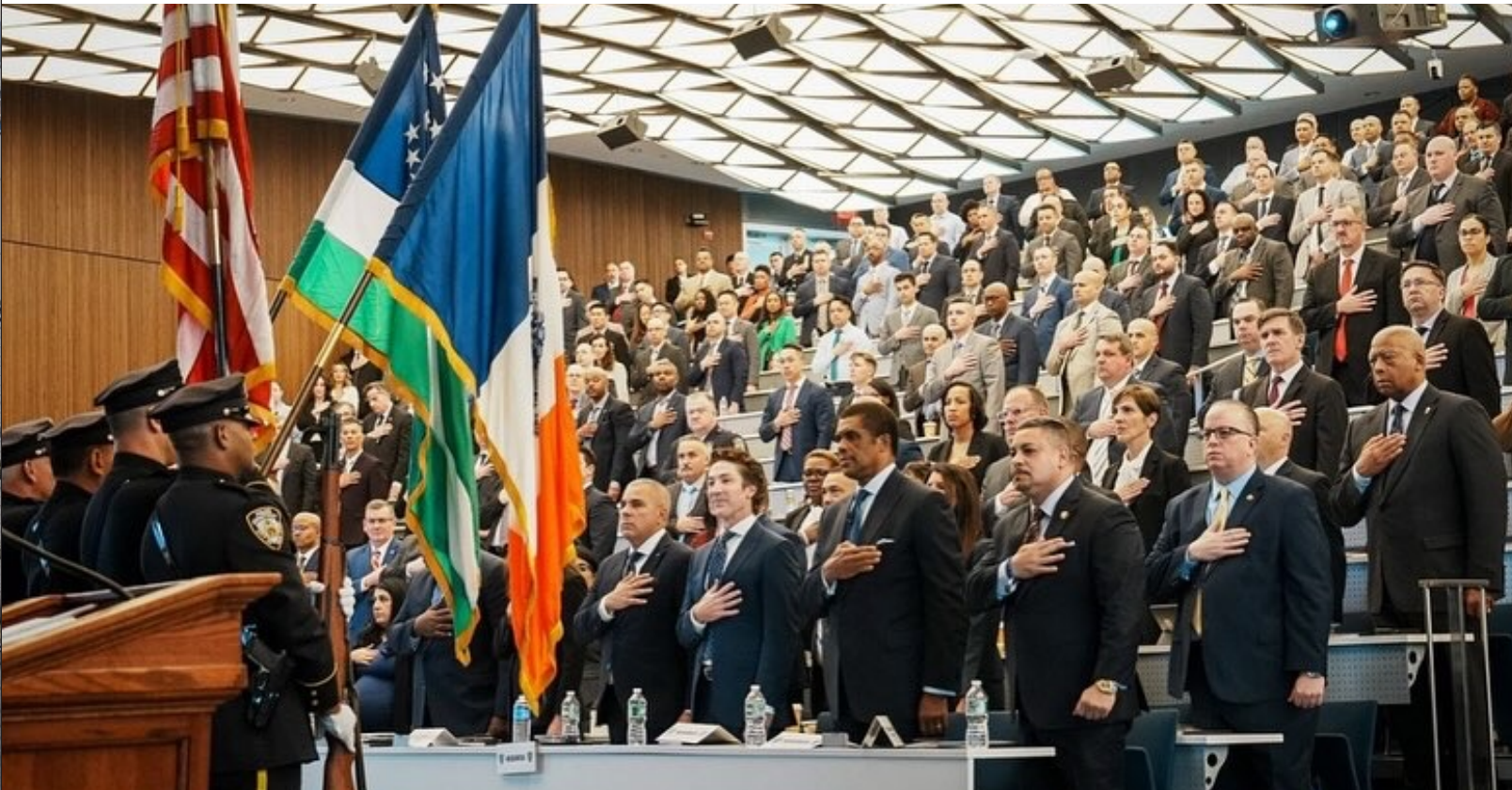
2024 NYPD In•know•vation Symposium held at the Police Academy in Queens, NY