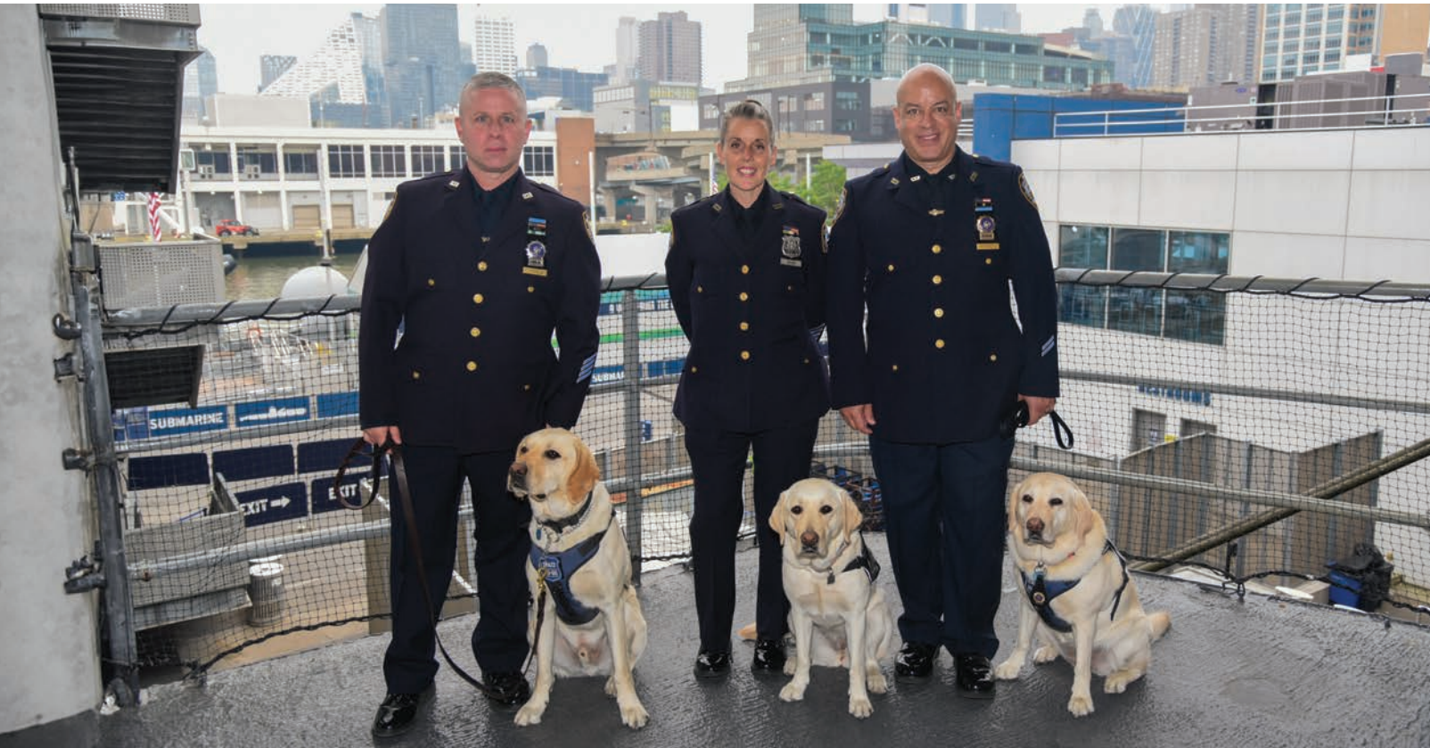
Members of the NYPD Health & Wellness Section with their emotional support canine partners

At the request of the NYPD Office of Professional Development , the Police Foundation sponsored the creation of The Commanders’ College , a two-week training program for commanders as they take on leadership positions within the Department. The training focuses on financial management, public speaking, human resources management, leadership essentials and wellness. From leveraging technology to fight crime & improve the working conditions for our officers, to strengthening the relationship between our precincts and the communities they serve, Commanding Officers take on a tremendous responsibility.